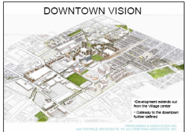
Proposed Downtown Vision Map Village of Hempstead, New York

F&A was retained by the Community Development Agency to prepare an update to the Comprehensive Plan, including a focus on the Village's downtown. This action-oriented, stakeholder-driven plan includes extensive community visioning, land use, zoning and urban design components, such as streetscape and adaptive reuse of vacant and under-utilized buildings, and issues associated with vehicular and pedestrian circulation and parking for the largest village (population 60,000) in Nassau County. Long-term components of the Downtown Plan include a capital improvements program and a market study that will assist the Village in conducting business recruitment efforts.