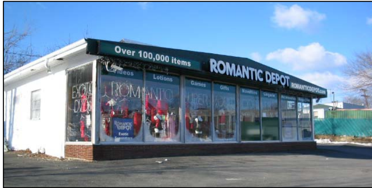
Existing Adult Use on I-287 Eastbound Ramp Elmsford, New York

F&A was retained by the Village of Elmsford to prepare an ordinance aimed at regulating the location of adult-oriented businesses in the Village. In addition, F&A prepared a secondary effects study and a planning analysis to determine the potential impact of adopting the proposed legislation, which was ultimately approved by the Village Board of Trustees. F&A continues to advise the Village on adult entertainment-related zoning and land use issues.