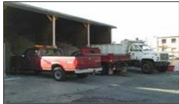
Existing Fort Lee DPW Yard New Jersey