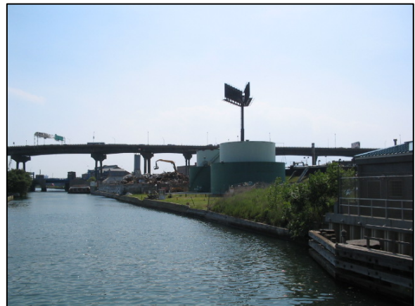
Existing views from the Gowanus Canal Brooklyn, New York