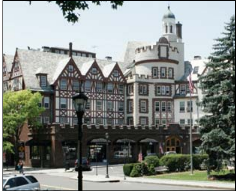
The "improved" Downtown Scarsdale New York

F&A was retained by the Town/Village of Scarsdale to develop a Downtown Infrastructure Improvement Plan to create better parking conditions, traffic circulation and pedestrian safety, as well as a more aesthetically pleasing environment as a result of new zoning, streetscape and design guidelines that were ultimately implemented. As part of the Plan , F&A conducted extensive community outreach and crafted a strategic partnership approach with a downtown committee to enhance the economic viability of the CBD and identify retail market niches for the Village to pursue. A $5 million capital improvement program, based upon the Infrastructure Improvement Plan , and reflecting the firm's recommendations, was implemented by the Village. In addition, F&A assisted in creating a Special Tax Assessment District to help finance the recommended improvements.